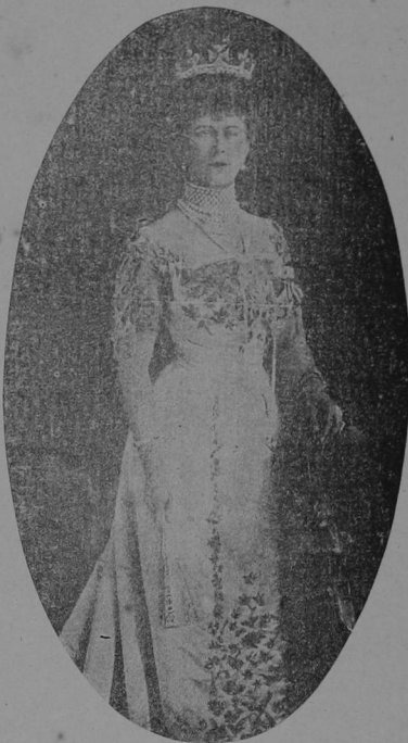
Her Majesty Queen Mary.

THE birth and life of King George V. is quite a familiar one to many, and does not need any artful skill and stratagem to explain. His life has been free and open for all men to see, and indeed he is deserving of great honor and admiration.