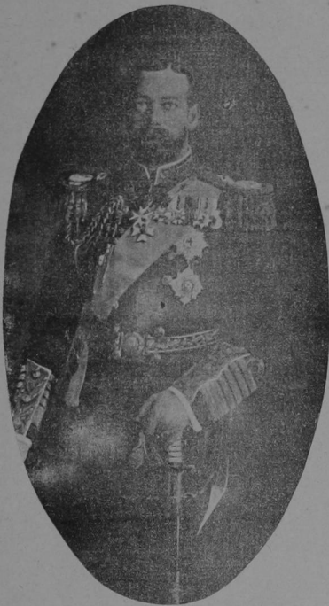
His Majesty King George V.